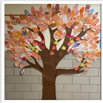
"THE KINDNESS TREE"

Girl Scouts is an organization that focuses on building girls of courage, confidence, and character who make the world a better place. In Girl Scouts, girls have an opportunity to build healthy relationships, explore the outdoors, have hands-on experiences in STEM, learn life skills, participate in creative arts, and so much more. They are expanding their horizons and reaching higher heights, as well as, unleashing the power of the inner G.I.R.L. (Go-getter, Innovator, Risk-taker, Leader)™. Through the Girl Scouts Leadership Experience, girls are discovering about themselves and the world around them, connecting with others, and taking action in their communities. Many girls are participating in Girl Scout troops with girls of their grade level, to learn progressive skills in STEM, outdoors, life skills, and entrepreneurship.