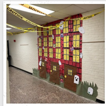
"THE CREEPY COVEN"