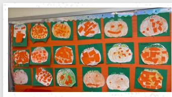
"THE PUMPKIN PATCH"